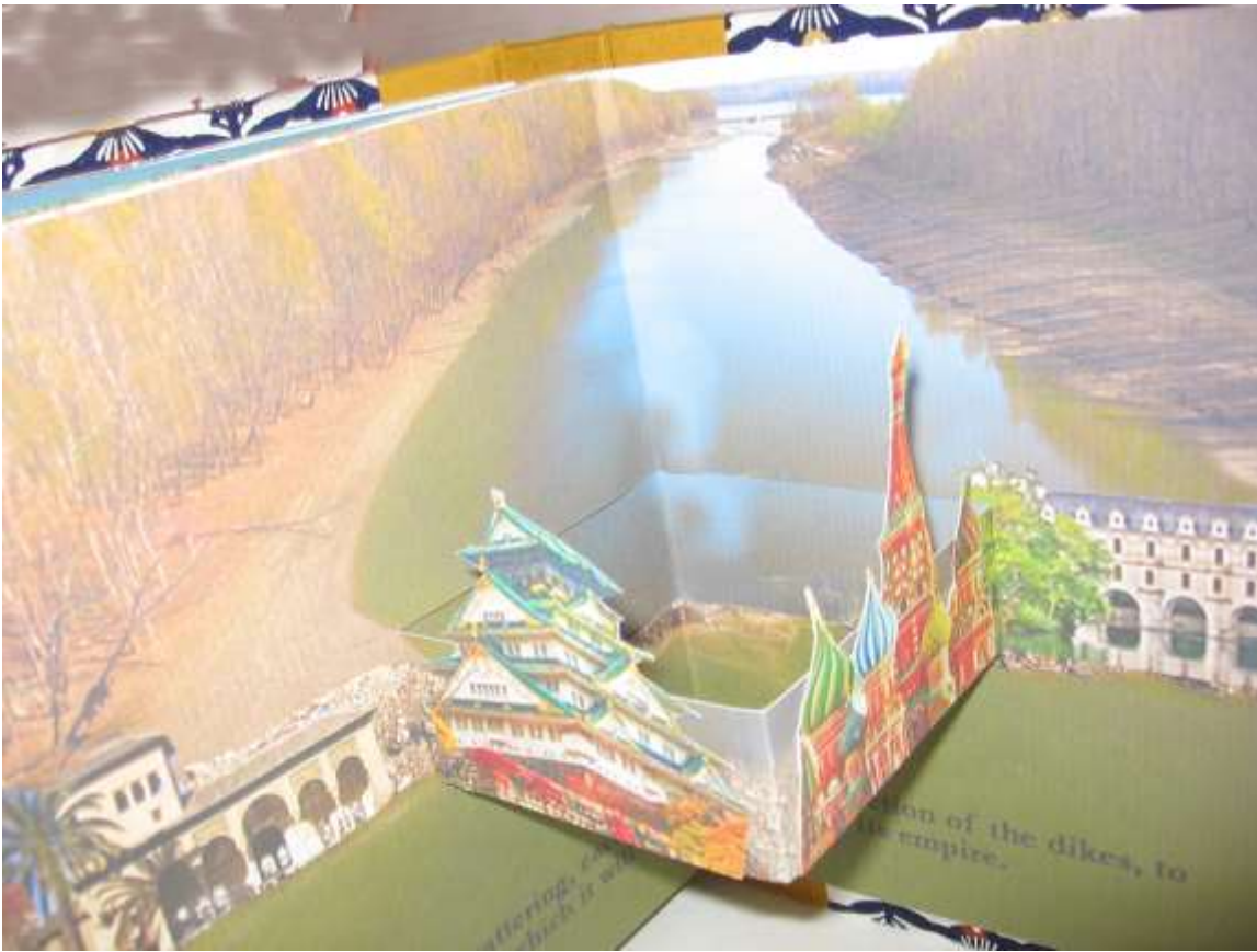
At the conclusion, each army built a section of the dikes in the mode of their nation.