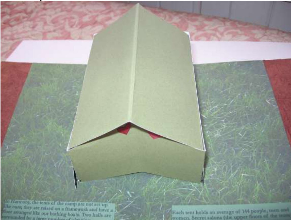
Sleeping quarters with secret salons.