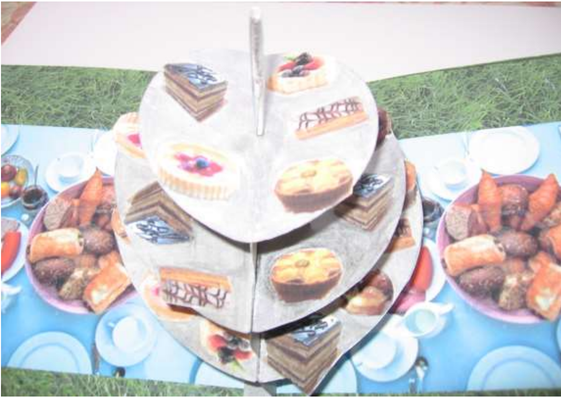
The final battle, which was a competition for the best pastries, among 60 armies.